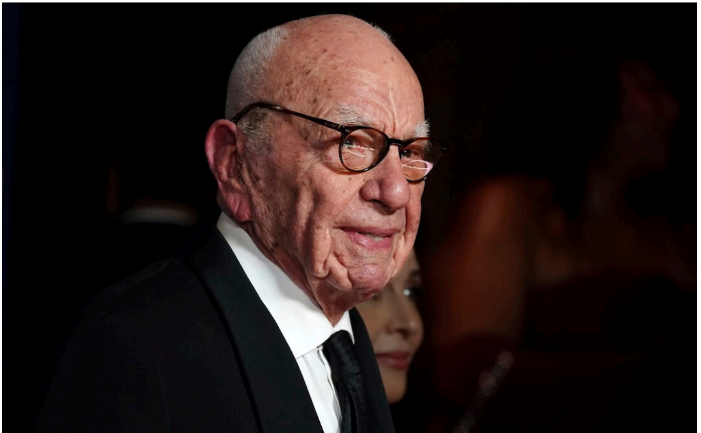
Rupert Murdoch arrives at the 11th Breakthrough Prize Ceremony on Saturday, April 5, 2025, in Los Angeles.