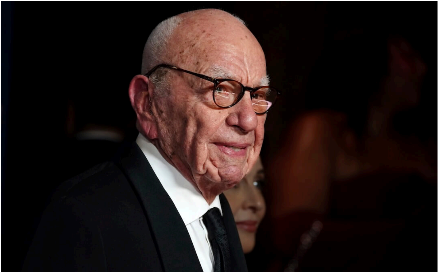
Rupert Murdoch arrives at the 11th Breakthrough Prize Ceremony on Saturday, April 5, 2025, in Los Angeles.

You must stand firm against Trump's $10 billion lawsuit to safeguard your legacy and uphold the values of free press at The Wall Street Journal